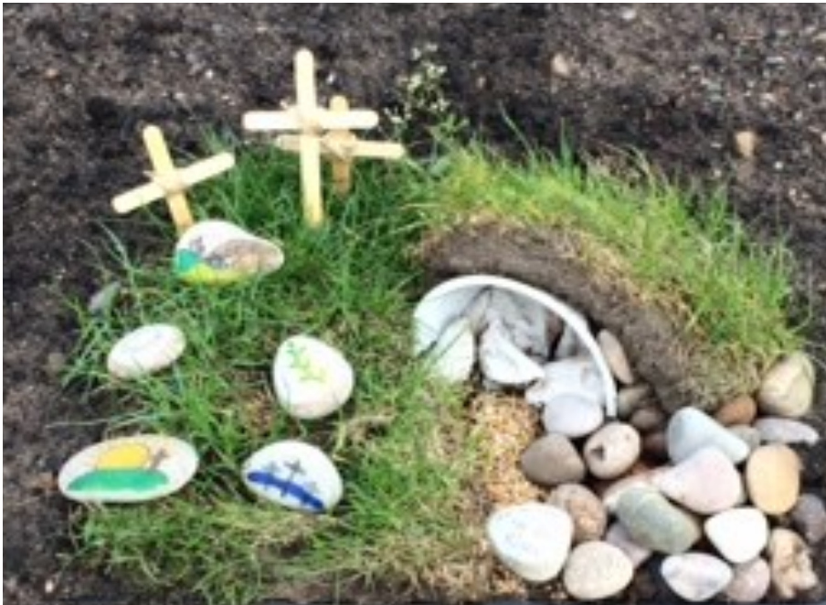
Resurrection Garden in Portland grounds

Our Father, who art in heaven, hallowed be thy name; thy kingdom come; thy will be done; on earth as it is in heaven. Give us this day our daily bread. Forgive us our debts, as we forgive our debtors. And lead us not into temptation; but deliver us from evil. For thine is the kingdom, the power and the glory, forever and ever. Amen.