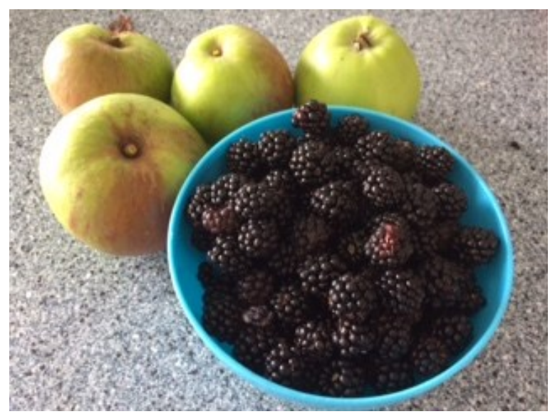
Gathered while walking the dog—Lotte likes brambles too