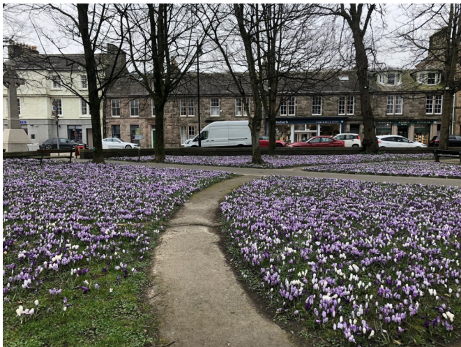
Beautiful display of crocuses in front of Kirkcudbright Parish Church