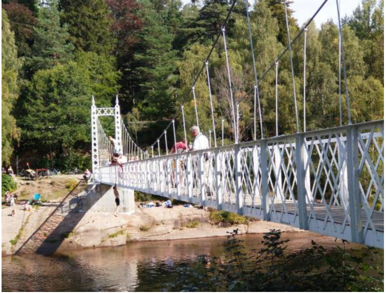
Cambus O'May Bridge