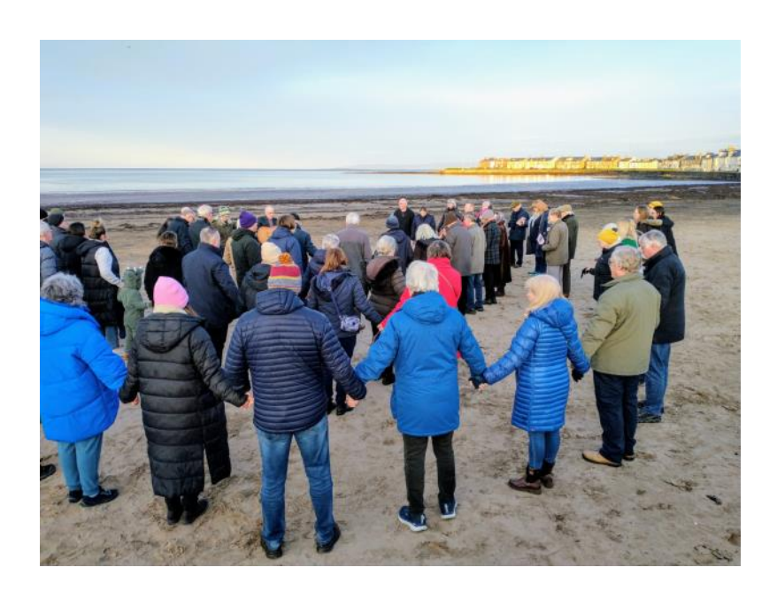
Easter Sunday at Troon Beach